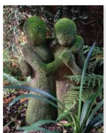
Mt Eden (Grange Manor)