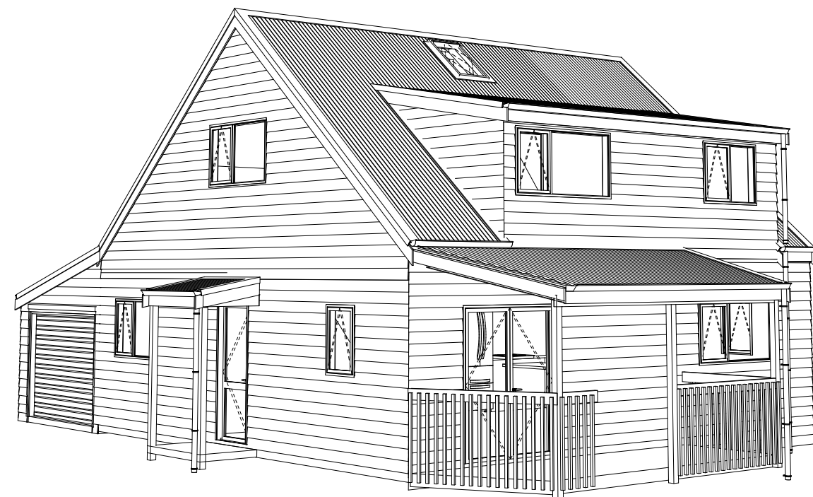
Northern Rear View