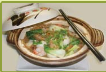
S5. Sapo Mee $12.50 Claypot mee cooked with chicken broth, seafood, egg and pok choy