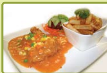
C9. Chop Chop Chicken $12.50 Deep fried boneless chicken served with special Malaysian tomato & butter gravy, French fries and salad