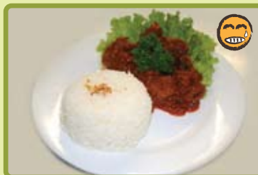
C6. Chicken Rendang $12.50 Dry chicken curry (bone in) cooked in traditional spices, galangal, lemongrass & coconut cream, served with jasmine rice