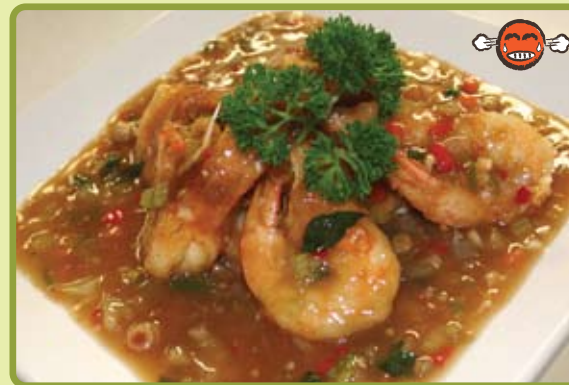
P1. Spicy Prawns $15.90 King prawns fried with traditional spices, lemon grass, curry leaves and fresh chilli, served with jasmine rice