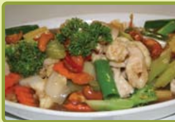
C13. Chicken Cashew Nuts $12.50 Braised chicken strips stir fried with crisp vegetables & topped with cashew nuts, served with jasmine rice