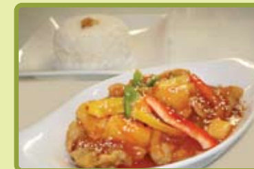
F1. Sweet & Sour Fish $12.50 Deep fried fish fillet cooked in sweet & tangy sauce, served with jasmine rice