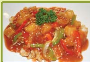
C12. Sweet & Sour Chicken $12.50 Fried chicken pieces cooked in a sweet & sour sauce, served with jasmine rice