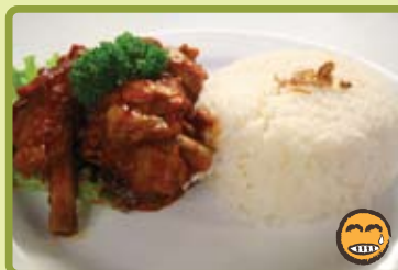
C7. Ayam Masak Merah $12.00 Traditional Malaysian chicken cooked in tomato puree, chilli paste & onion, served with jasmine rice