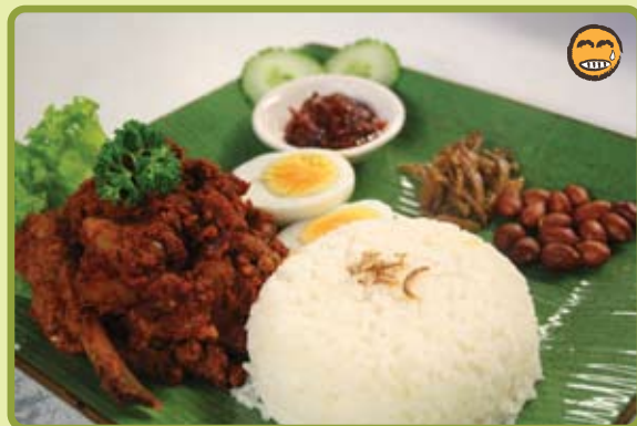
C1. Nasi Lemak Chicken Rendang $14.50 Dry chicken curry served with coconut rice, hard boiled egg, sambal, fried anchovies and roasted peanuts