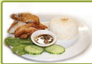
C10. Roast Chicken $12.00 Crispy roast chicken, served with jasmine rice