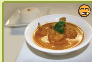
C3. Chicken Curry $12.50 Malaysian curry cooked in traditional spices & coconut cream, served with jasmine rice