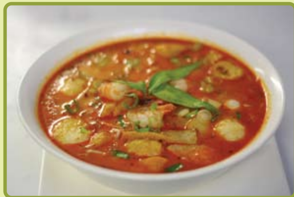
S4. Seafood Curry Laksa $13.50 Fresh yellow noodles, vermicelli, bean sprouts, tofu & seafood cooked in a rich coconut curry soup