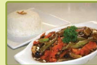
F2. Black Bean Fish $12.50 Deep fried fish fillet cooked in a fragrant black bean & garlic sauce, served with jasmine rice