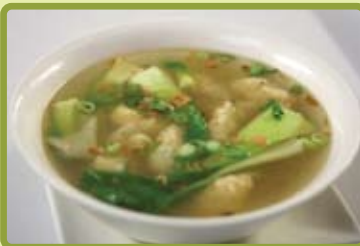
S2. Wonton Soup $11.00 Chicken and Prawn dumplings cooked with chicken broth and pok choy

Please specify Non Spicy Mild Medium Hot Extra Hot