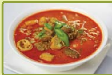
S3. Chicken Curry Laksa (bone in) $12.00 Fresh yellow noodles, vermicelli, bean sprouts, tofu & chicken cooked in a rich coconut curry soup