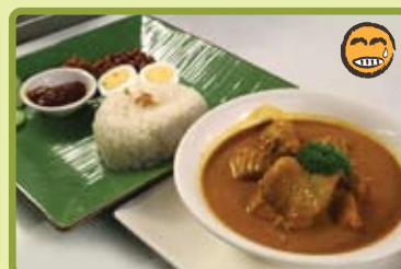
C4. Nasi Lemak Chicken Curry $14.50 Chicken curry served with coconut rice, hard boiled egg, sambal, fried anchovies and roasted peanuts