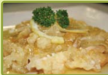
C11. Lemon Chicken $12.50 Boneless chicken fillet cooked in tangy lemon sauce, served with jasmine rice