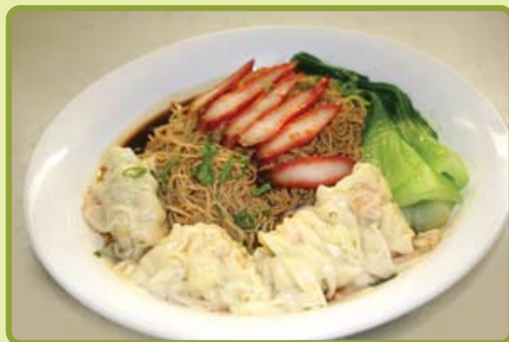
S1. Wonton Mee - Soup or Dry $11.50 Chicken and Prawn dumplings cooked with chicken broth, thin egg noodle, chicken "char siu" and pok choy