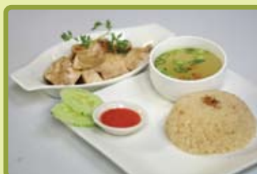
C8. Hainanese Chicken $12.50 Slow poached chicken served with soup and chicken flavored rice