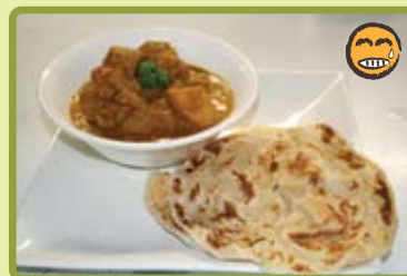
C5. Chicken Curry with Roti $15.00 Chicken curry served with 2 flanky roti breads