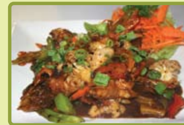
P2. Black Bean Prawns $15.90 Succulent king prawns stir fried in a fragrant black bean & garlic sauce, served with jasmine rice