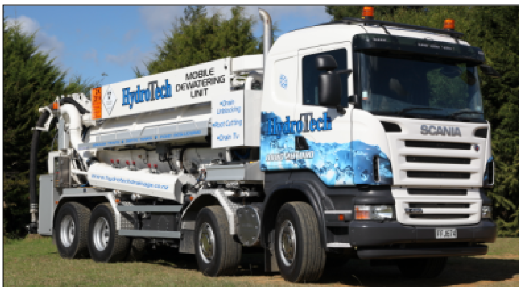
HydroTech's Mobile Dewatering Unit: The Maskoflex

Have your grease trap serviced on a regular basis by a reputable drainage company who really knows the drainage and your business– it is not a cost – it is a necessity. Don't take risks with your business – it is not worth it.